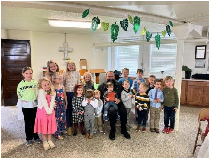
The Sunday School and Adult Bible Class enjoyed Pancakes with Pastor at the 2 nd annual event.