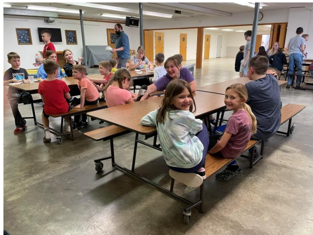
Midweek March 13, 2024